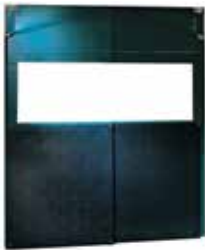
AirGard Model 300

Jamb Edge – 2” balloons are provided on the jamb edge for a superior seal that saves energy.